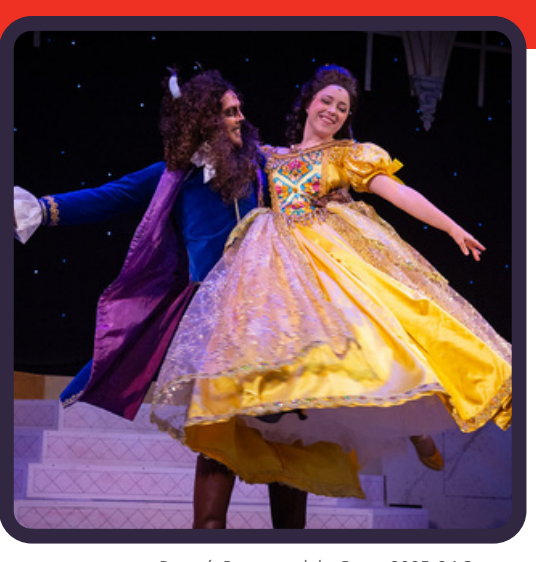
Disney's Beauty and the Beast, 2023-24 Season

SEE BELOW for program selection, deadlines and pricing. To learn more about the season, visit grct.org/season24-25 .